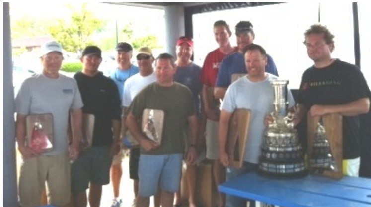
Winners at the 2012 Blue Star.