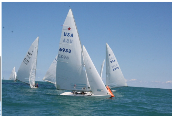
Boats coming into a mark rounding at the 2012 Fourth District Championship.