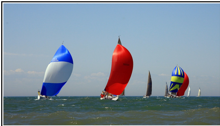
Spinnaker boats on a windy day in St Joe for the Rhumbline Regatta 2012