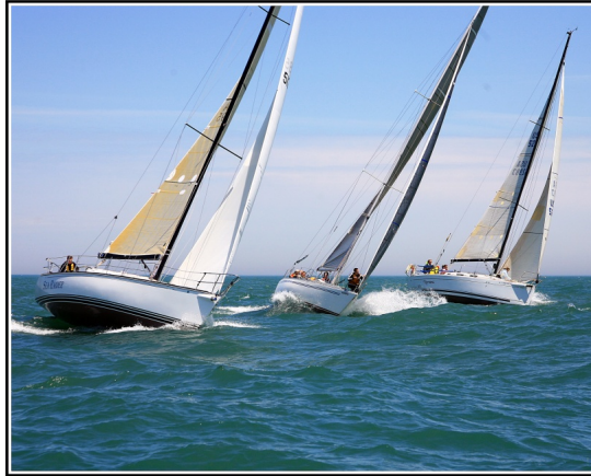
Start of JaM 1 shows Sea Raider across the line slightly ahead of Carrera, with Nirvana next in line. These boats would finish 1, 2, 3, with Carrera first, Sea Raider second, Nirvana third.