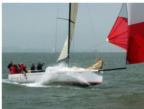
The Flying Tiger 10. Class Photo.