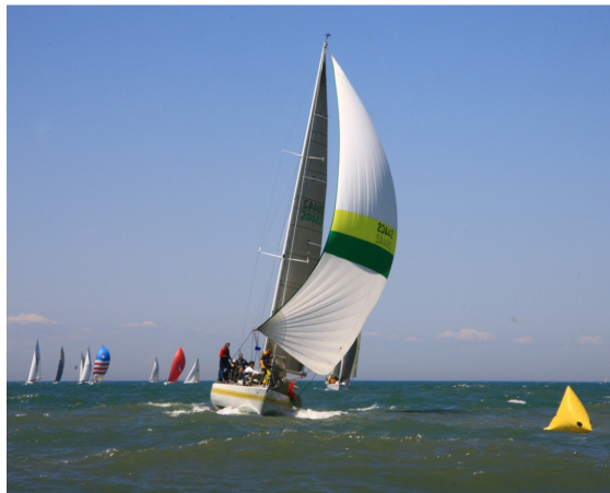
Winner of Spinn 2, Dandelion, leads the fleet.