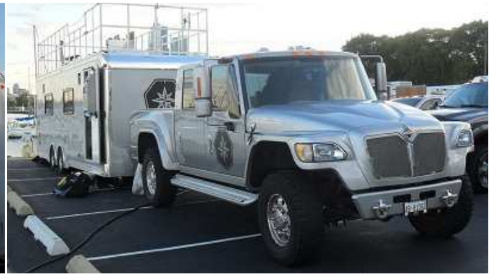
Team Morningstar Group mobile unit ...