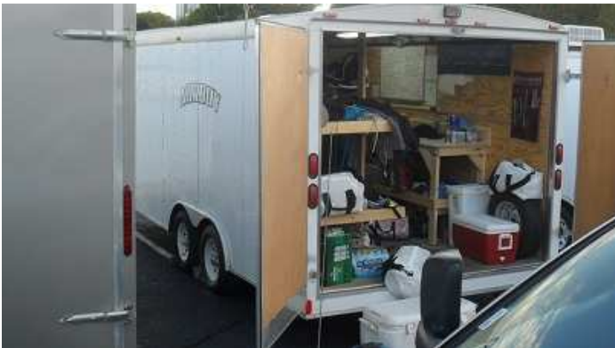
Team Norboy remote unit ...