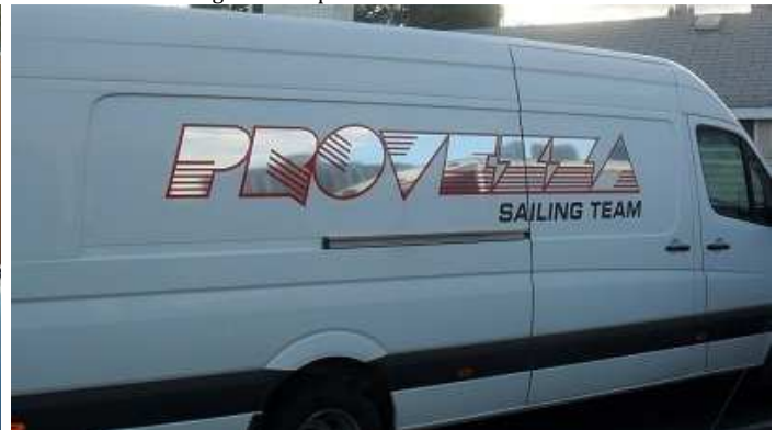
Team Provezza self contained ...