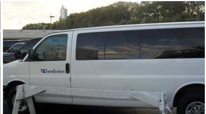
Pulled by a team hauler ...

Then there were the coach/support boats -