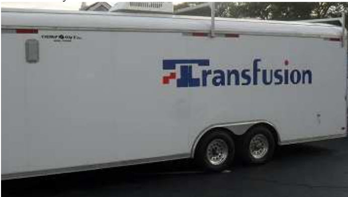
Team Transfusion enjoys an air conditioned workroom ...