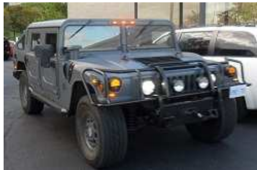
The Canadians sport the military look.

Doing some math, it appears that the boat and sails is only one-half of the cost of a Farr 40 Worlds, the other half is the containers, coach boats, vehicles, and crews. Yowza!