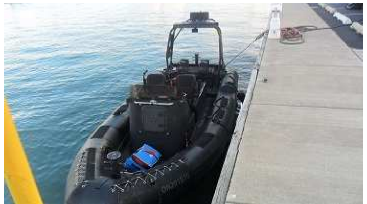
The Canadians have an inboard engine with a jet drive.