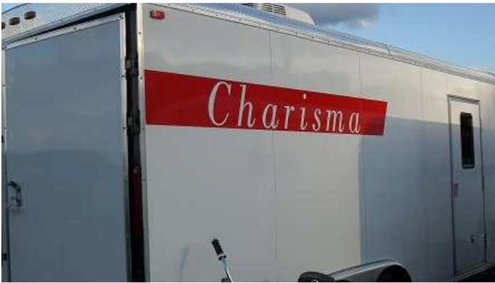
Team Charisma trailer ...